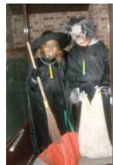
Area children dressed in costume wearing glow sticks.