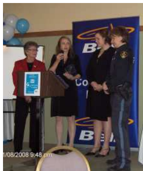
RRVSC partners accepting the Safety Award.

As a member of the RRVSC, we are proud to say that the program has reached provincial recognition, with other regions in the province starting to use the school-based distribution system.