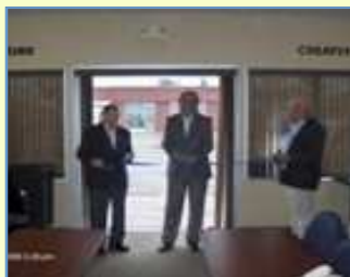
Official Ribbon Cutting.

A big thank you to all staff involved for all their hard work.