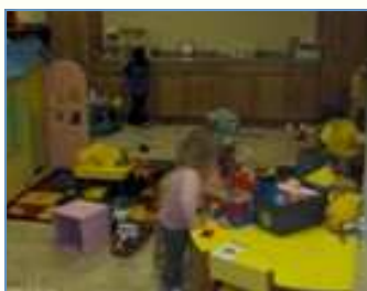
Children enjoying the newly appointed play room.